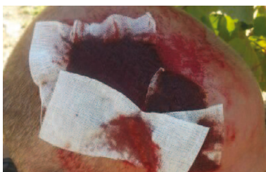
A. 2 minutes post application

Another very important point to note is that, on average, WoundClot® can be left in the wound, with no need to extract or irrigate later. It's broken down by the body and absorbed fully within 7-10 days, with any unabsorbable amounts of cellulose simply being expelled by the patient via urination.