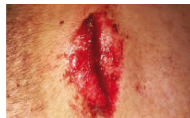
C. 8 minutes post application